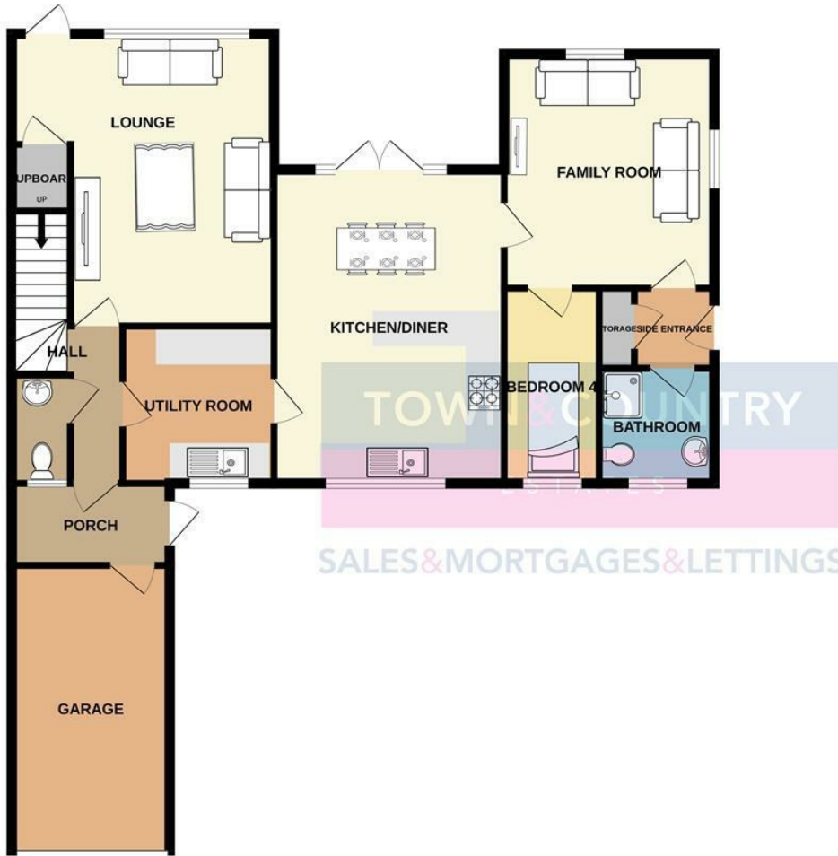
GROUND FLOOR 1071 sq.ft. (99.5 sq.m.) approx.