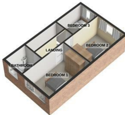
TOTAL FLOOR AREA : 1444 sq.ft. (134.1 sq.m.) approx.

For illustrative purposes only. Decorative finishes, fixtures, fittings and furnishings do not represent the current state of the property. Measurements are approximate. Not to scale. Made with Metropix © 2025